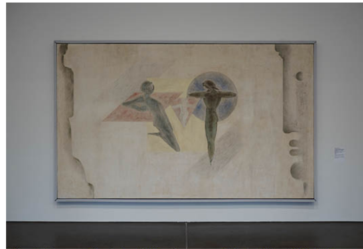
Oskar Schlemmer, Mural „Family“ for the house of Dieter Keller, 1940, 4,50 x 2,20 m, State Gallery Stuttgart, removed 1995 before the demolition of the house

In the last journal we called for the participation in the donation action „Schlemmer’s ‚family‘ must remain in Stuttgart“. We are very happy to announce that a short time later the Schlemmer painting was able to be purchased. 250 donators contributed a total of half a million Euros! The remaining amount for 1.95 million Euros was donated by the Museum Foundation Baden-Wurtemberg and the Cultural Foundations of the german states. Thankfully the paintings can now be visited in the entrance hall of the State Gallery in Stuttgart.