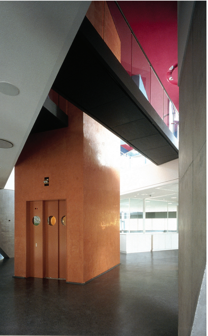
Office and Administration Buildings