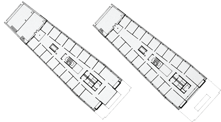
Communication Building Sto AG

The building itself acts as a business card or landmark for the company. At the same time, the dynamics of the building, aside from embodying a stunning example of corporate architecture, are a positive architectonic element in the landscape. The different functions of the building are expressed in different volumes and layers. The headquarters comprise of three elements: marketing offices, an oval entrance pavilion and a square base containing training facilities. Sto AG is an international player in the field of colour facade and coating systems. Their headquarters are in Stühlingen, a small village in south-west Germany not far from the Swiss border. The beautiful location in the region of the southern Black Forest demands high quality planning and design for all new buildings. Furthermore, the client requested a building, which symbolises that the company is „on the move“.