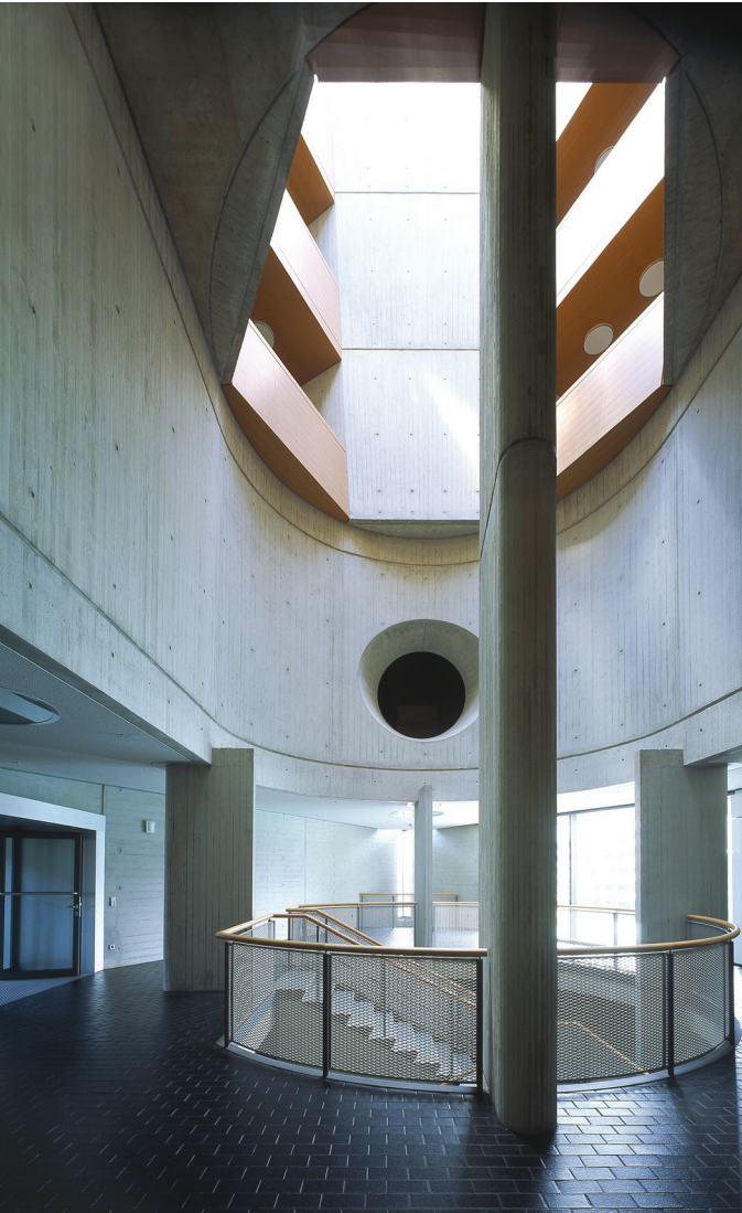
Office and Administration Buildings