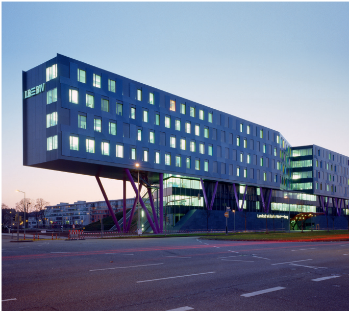
Regional Headquarters of a Bank, Karlsruhe, New Building Planning period 2004 Construction period 2005-2007 Location Ludwig- Erhard-Allee 4, 76131 Karlsruhe GFA ca. 22.277 m 2 Scope 1-8 Client LBBW Immobilien Management GmbH Costs 28,7 Mio €